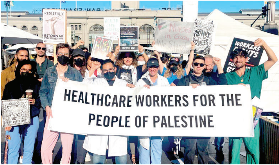
Healthcare workers from a variety of hospitals pose for a photo after a demonstration in San Francisco.