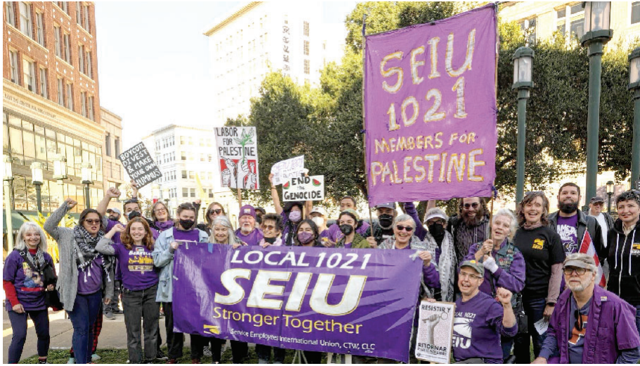
SEIU 1021 members at the Labor for Palestine march in Oakland.

forging more extensive bonds with each other through a combination of previously existing political connections, a national petition that connected signatories, visibility at marches, word-of-mouth, and ever-growing Signal and WhatsApp group chats.