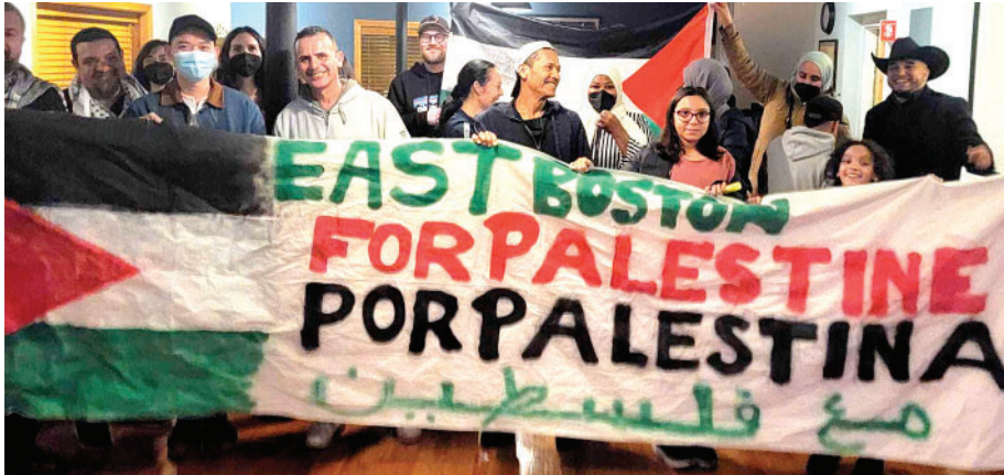
Members of the East Boston for Palestine neighborhood group pose for a photo after a film screening and discussion.